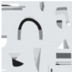
New York 6750-801